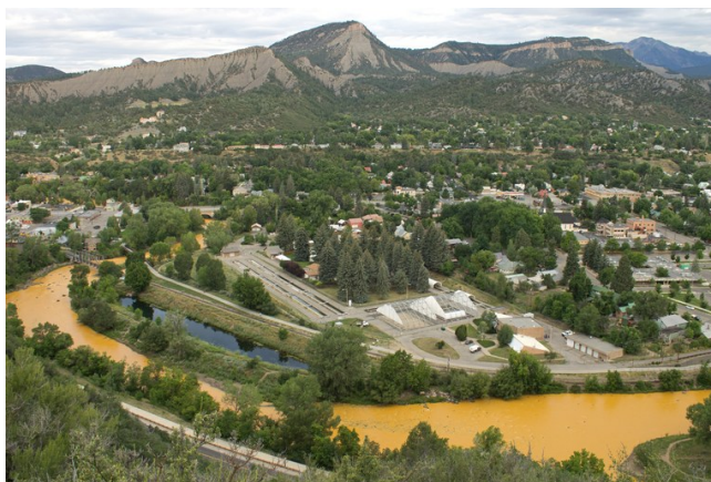
The contaminated Animas River as it runs through Durango. Note the contrast between the river and a fish hatchery pond next to it.

messed with it at all, though, the gathering water and sludge might have busted through the de facto dam sometime anyway. Clearly, the water quality issue goes far deeper than this one unfortunate event.