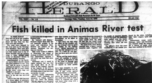
A 1975 tailings pile breach just above Silverton sullied the Animas River for 100 miles downstream, turning the water the color of 'aluminum paint' and killing fish.

• Short-term impacts aren't as bad as the water looks: Sampling done by the EPA