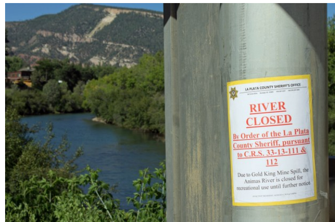
The Animas River was closed for public safety as the wastewater plume moved through town.

Really, though, the EPA wasn't the root cause of the emergency. It was, most likely, a disaster waiting to happen and the most visible manifestation of an emergency that's been going on in the Upper Animas River Watershed for decades. Here's nine items to help you understand the big picture: